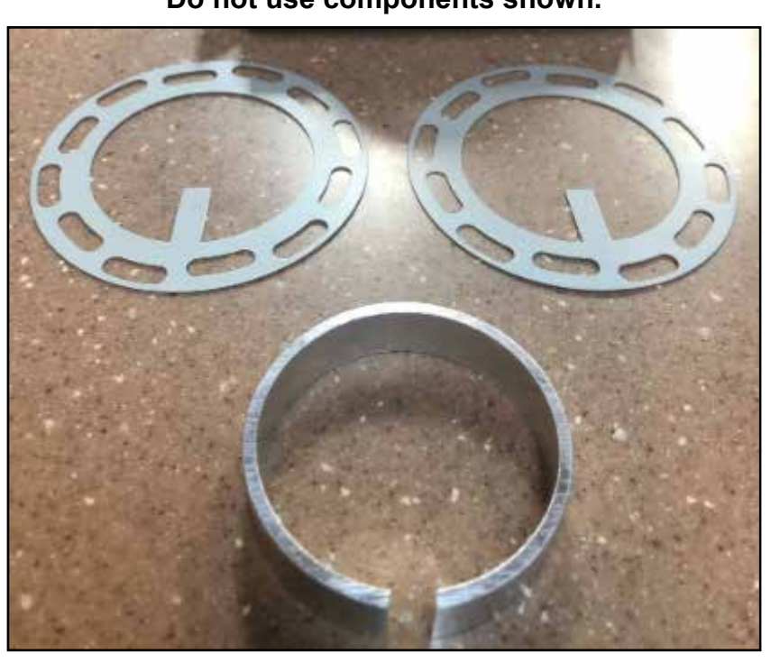
Do not use components shown.